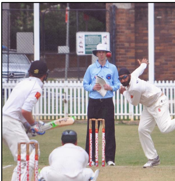
Monty Panesar bowling from my end

The game proceeded fairly smoothly. We had a small shower just at the starting time, and also had cause to report one of the batsmen. Western Suburbs had earlier won the toss against Campbelltown-Camden and had chosen to bat on a greenish pitch with some drizzle around. They scored fairly freely through the day, notching up 8/307. The bowler was on a hat trick when they declared! I thought it was a really good score given how slow the outfield was. I think the only time I've seen slower was when I played at Rosalie Park in Shenton Park. Coincidentally, I was playing against Western Suburbs in the WASTCA – maybe slow outfielders and Western Suburbs go together. Western Suburbs bowled for 10 overs at the end of the day and managed to have Campbelltown at 2/24 overnight.