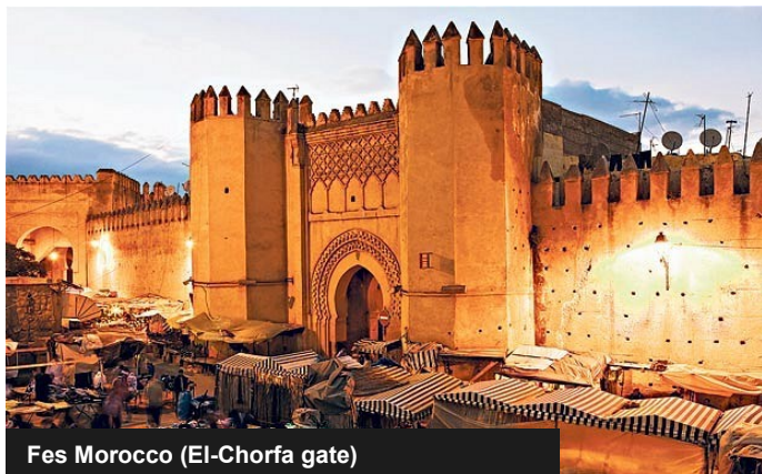
Fes Morocco (El-Chorfa gate)